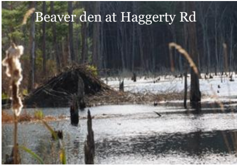
Beaver den at Haggerty Rd

will end up as a meadow. Trees will overtake the meadow, which will invite beaver to move in and dam up any streams flowing through the woods.