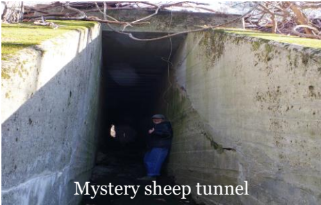
Mystery sheep tunnel

We'll also be working on acquiring more open space. There might even be a sheep (skinny cow?) tunnel or two involved! There will be more news to share as things evolve. Every subdivision comes with a silver lining.