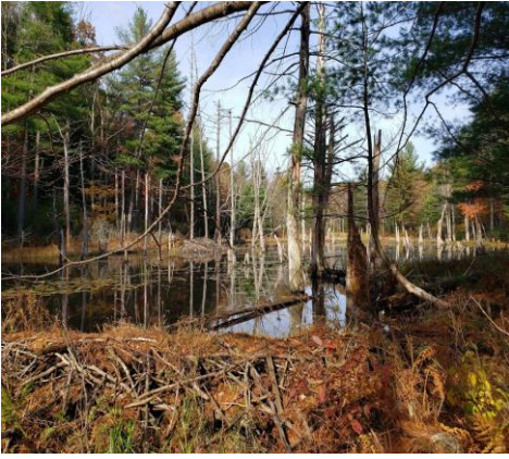
Autumn at Owl Swamp